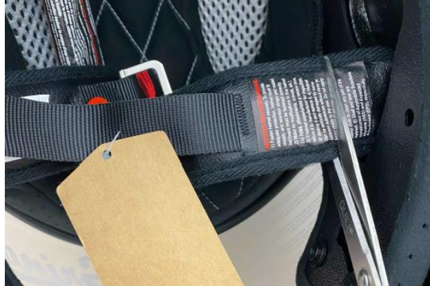
Step 5) Place the two cut straps (one of them will include E13 ECE serial number) in an envelope or a small box. Every strap needs to be packed with the corresponding RA N° (see picture below). A customer service agent will assist you with the process and will inform you when UPS will pick up the package. When received, we will issue a credit memo.